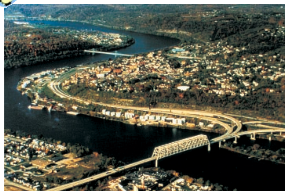
Ohio River at East Liverpool