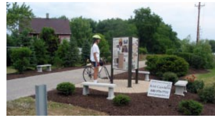
H. L. Morrison Station, Ashtabula

You can help make this vision a reality! Together we can complete a Greenway that will provide recreation, health, pride and prosperity to this unique region and its communities. To offer your assistance at any level, please call or write to the contact in your area: