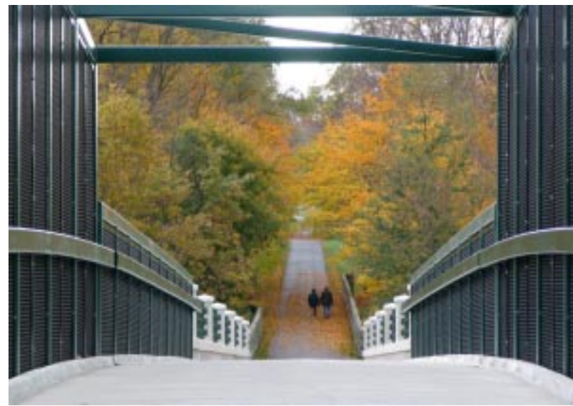
Mahoning Avenue Overpass, Mill Creek MetroParks